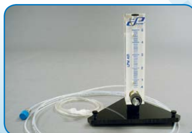
Gas flow meter kit