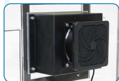
Positive airflow adapter kit for ENC-560 Integrated Enclosure