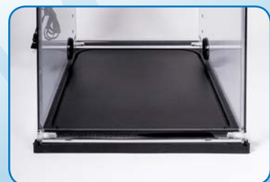
Optional DC enclosure base