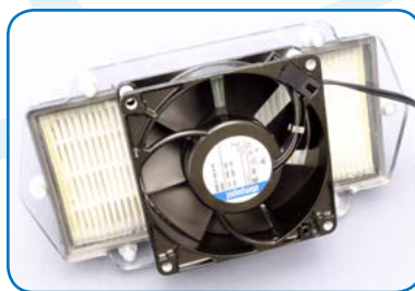
Positive pressure fan and HEPA filter for DC Enclosures

Rigid base. DC Enclosures can be fitted with an optional base for use on irregular surfaces.