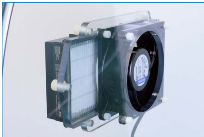
Filtered positive pressure enclosure. When fitted with the optional fan and HEPA filter, the enclosure provides a positive pressure enclosure.